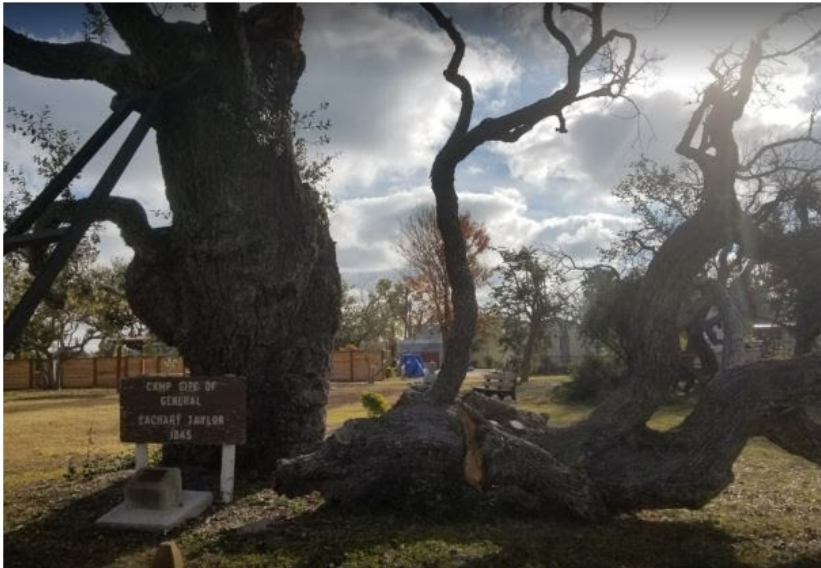
The tree after Hurricane Harvey