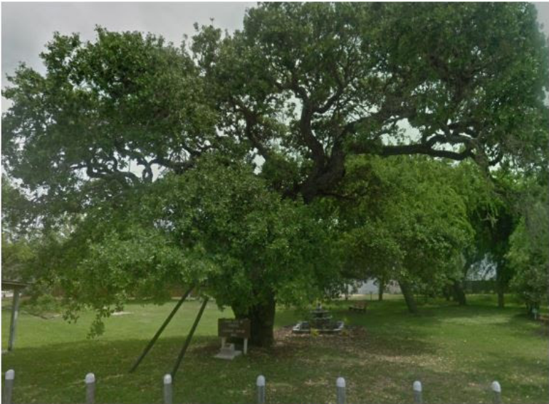
The Zachary Taylor tree in 2011

As with every other tree in the Rockport area, the Zachary Taylor tree was badly damaged by Hurricane Harvey, but the city of Rockport has been working to save this historic tree.