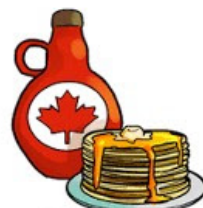
National Maple Syrup Day