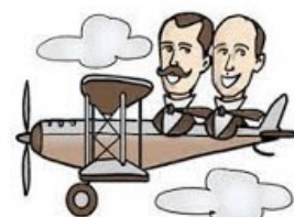
WRIGHT BROTHERS DAY