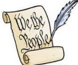
Bill of Rights Day