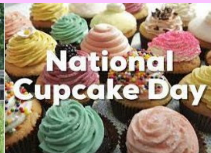
National Cupcake Day