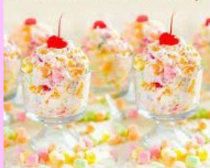
National Ambrosia Day