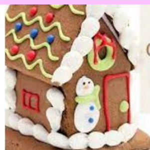
National Gingerbread House Day