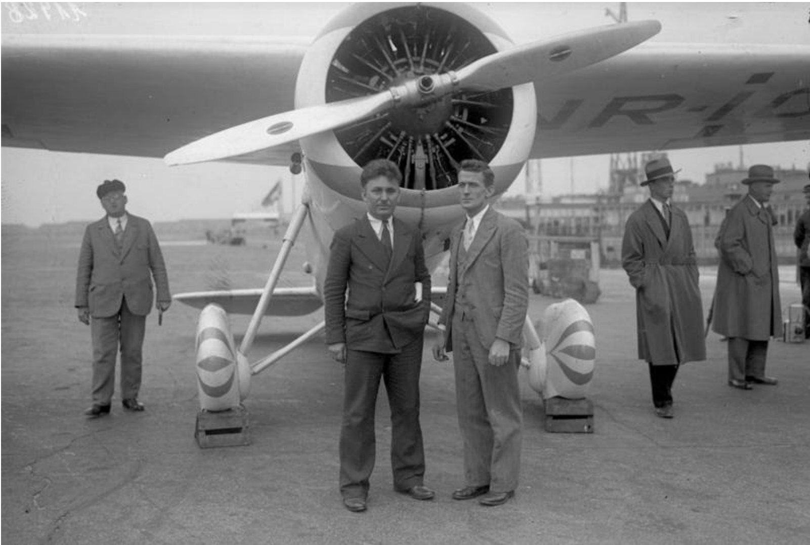
Juni 1931

Two years later, Post beat his earlier time by more than twenty-one hours. He may be most famous, however, for piloting the plane in which he and humorist Will Rogers died at Point Barrow, Alaska, on August 15, 1935.